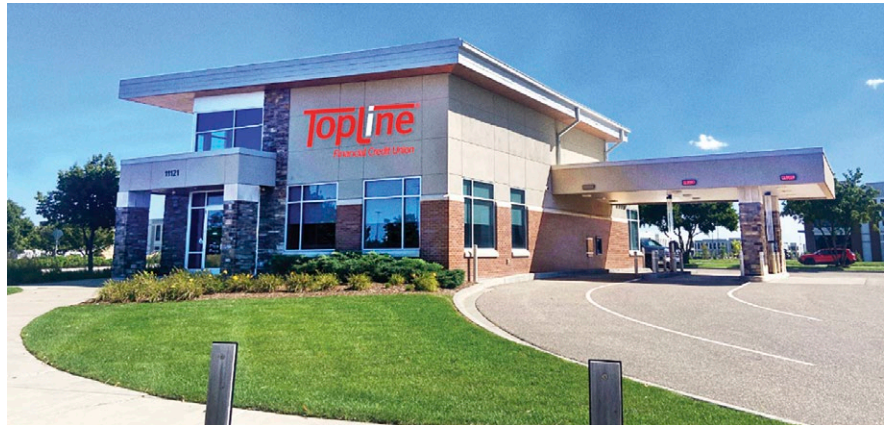
Starting October 21, we're excited to welcome you to our new Maple Grove–Arbor Lakes branch!

We are excited to welcome you to our new Maple Grove–Arbor Lakes branch starting October 21, 2024. The new branch will be located at 11121 Fountains Drive in Maple Grove —off Zachary Lane and Fountains Drive, across from Costco and Lowe's Home Improvement.