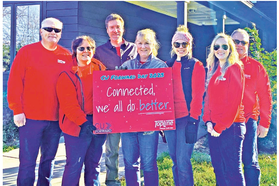
TopLine volunteers spent the morning doing yard work for local youth shelters

the 76th anniversary of International Credit Union Day. Credit Unions were built on the principle of “ people helping people. ” Thank you for being a part of the TopLine family!