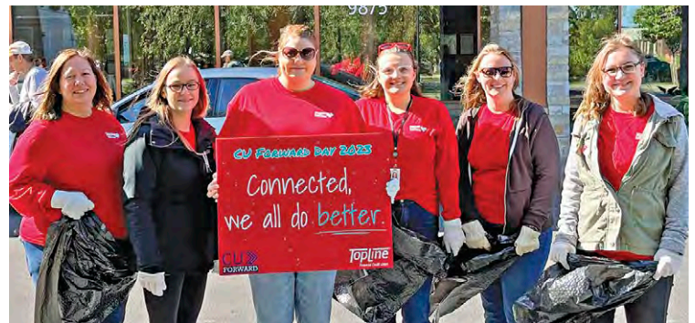
TopLine volunteers helped clean up the Maple Grove Hospital campus.

A great day working as a team to make a positive impact in our communities!