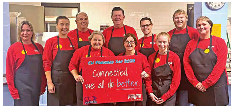
TopLine volunteers spent the afternoon serving lunch to residents at a local ministry.