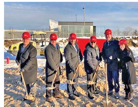
Groundbreaking in December 2022