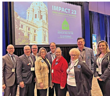
Leaders from your credit union participated in an advocacy event at the Minnesota Capitol to advocate for the credit union message with elected officials.

TopLine had the opportunity to be a part of IMPACT 23: CU Day at the Minnesota Capitol on January 25, 2023. This day provides credit union professionals and volunteers the unique opportunity to learn about legislative issues and meet with elected officials.