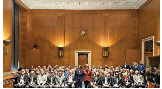
TopLine met with U.S. Senators Amy Klobuchar and Tina Smith and House members—focusing on modernizing credit union service, securing data to protect consumer privacy and improving financial well-being.