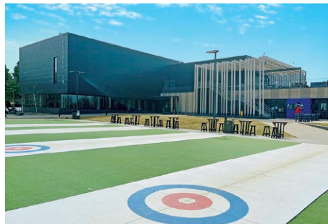
TopLine's Lawn Bowling Fundraiser will be held at Brookview Golf and Lawn Bowling.

TopLine Credit Union Foundation is hosting its seventh Charitable Lawn Bowling Fundraiser on Thursday, July 20. It will be a great day for all filled with lawn bowling, fundraising, networking and more! Proceeds are