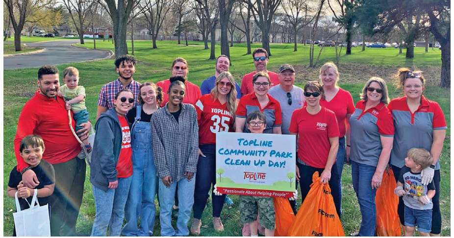
TopLine's DEIA Advisory Group and Employee Engagement Committee team up for park clean-up day.

TopLine Credit Union Foundation is a 501(c)(3) non-profit organization. Donations are tax deductible to the extent allowed by law. For more information or to make a tax-deductible donation, visit www.TopLinecu.com/foundation , call 736-391-9494, email Foundation@TopLinecu.com , stop by any branch location or write to: 9353 Jefferson Highway, Maple Grove, MN 55369. Federal Tax ID # is 46-4335752.