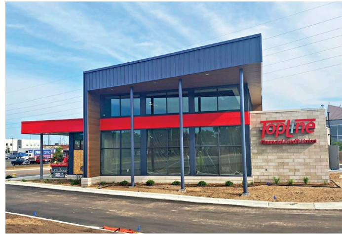
Our new Bloomington branch construction is coming along!

📍 We look forward to expanding our services to serve the broader communities of the southwest metro. Stay tuned for updates on our Grand Opening date!